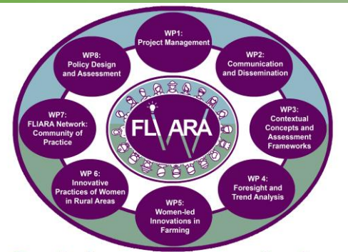
Female Led Innovation in Agriculture and Rural Areas