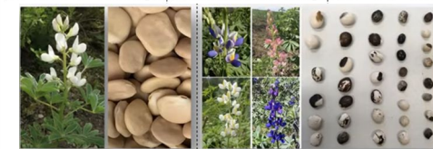
White lupin Lupinus albus (2n=50; ~450Mbp) Andean lupin Lupinus mutabilis (2n=48; ~930Mbp)

Call: H2020-Sustainable Food Security-2018-2020