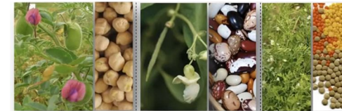
Chickpea Cicer arietinum (2n=2x=16; ~740Mbp) Common bean Phaseolus vulgaris (2n=2x=22; ~520Mbp) Lentil Lens culinaris (2n = 14, ~4Gb)